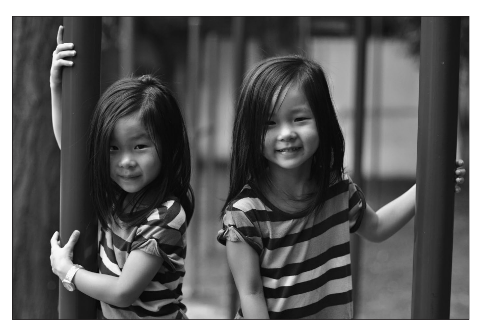
No two people, not even identical twins, have exactly the same personalities.

However, personality theorists have not agreed on a single definition of personality. Indeed, they evolved unique and vital theories because they lacked agreement as to the nature of humanity, and because each saw personality from an individual reference point. The personality theorists discussed in this book have had a variety of backgrounds. Some were born in Europe and lived their entire lives there; others were born in Europe, but migrated to other parts of the world, especially the United States; still others were born in North America and remained there. Many were influenced by early religious experiences; others were not. Most, but not all, have been trained in either psychiatry or psychology. Many have drawn on their experiences as psychotherapists; others have relied more on empirical research to gather data on human personality. Although they have all dealt in some way with what we call personality, each has approached this global concept from a different perspective. Some have tried to construct a comprehensive theory; others have been less ambitious and have dealt with only a few aspects of personality. Few personality theorists have formally defined personality, but all have had their own view of it.